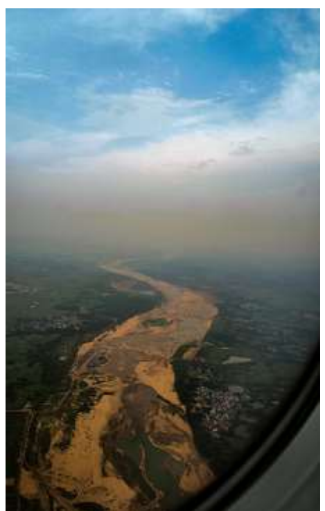
Swastik Sinha, FE E&Tc