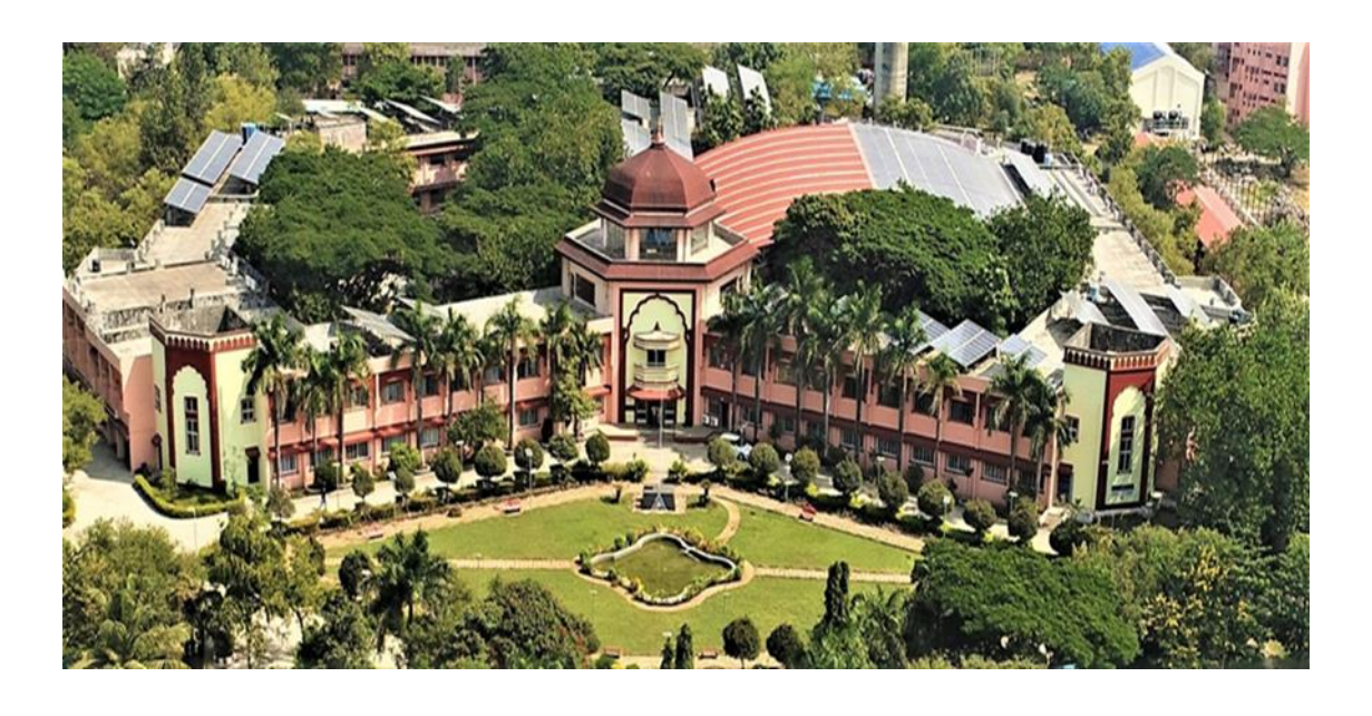
First Year B. Tech. in Automation and Robotics (2025 Pattern)